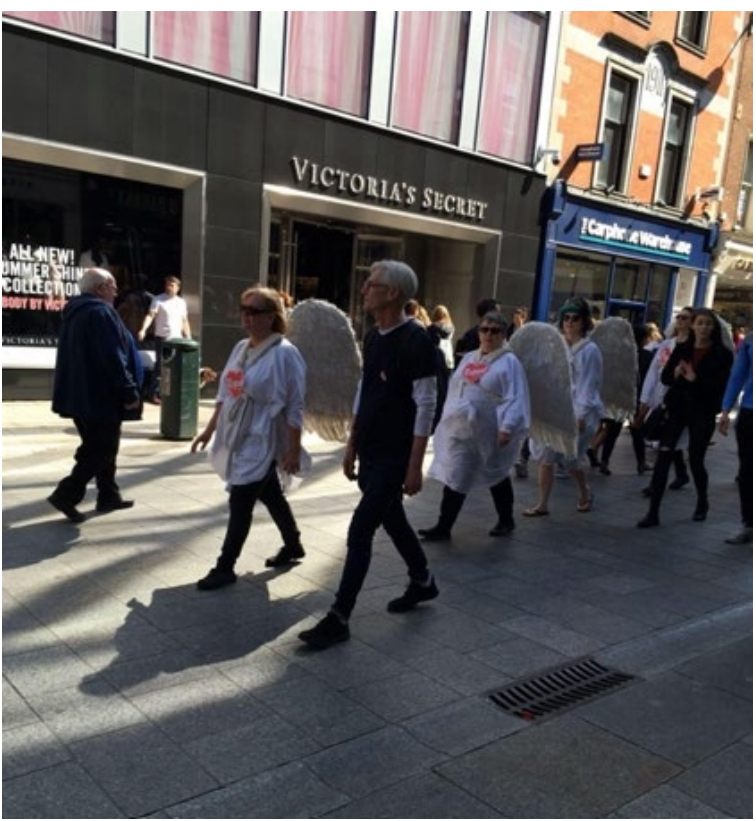
Figure 3. Angels for Choice demonstration, 18 May 2018, Grafton Street, Dublin.

displays; they contribute and validate alternative notions of gendered and sexual embodiment which have radical potential to transform contemporary reproductive rights debates.