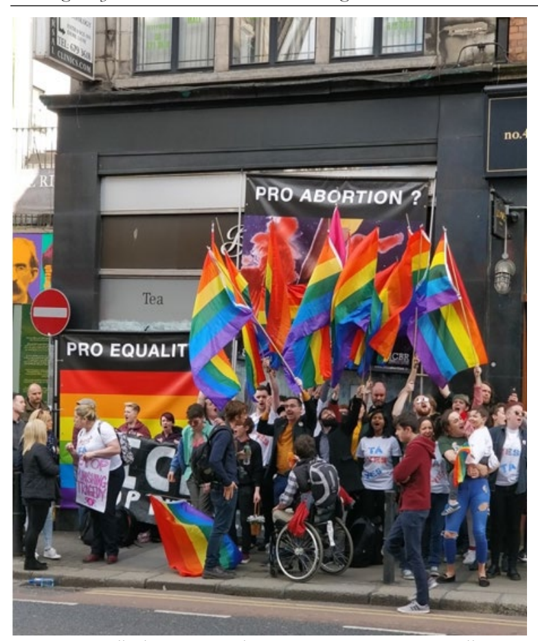
Figure 1. Radical Queers Resist counterprotest on 17 April 2018, Georges Street, Dublin.

displays. Both the Angels for Choice and Radical Queers Resist activists used their bodies as well as LGBTQ flags to 'cover up' or 'block out' the graphic foetal images. By positioning themselves in between the anti-abortion posters and passers-by, the Angels for Choice and the Radical Queers Resist activists interrupt the almost panopticon-like gaze of the anti-abortion movement and the broader culture of reproductive surveillance and coercion which these images exemplify and sustain (O'Shaughnessy 2024).