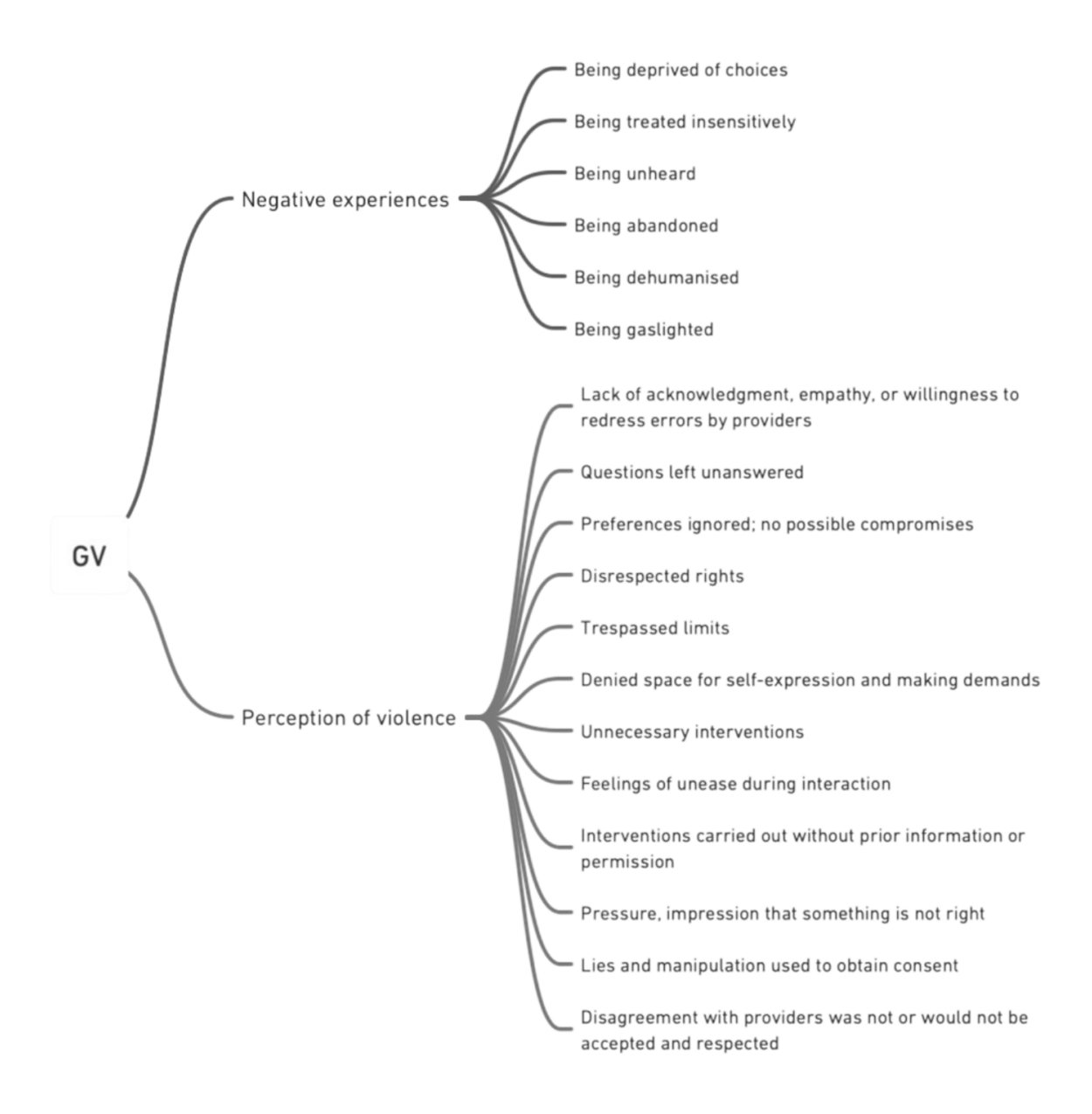
Figure 1. GV = Experiencing at least one negative moment + perceiving it as violent (2024)

not subjectively seem violent, they could still objectively be so. However, what ultimately matters most to them is how they feel about the experienced moment, as their subjectivity influences the event's repercussions on their well-being. Vic explained: