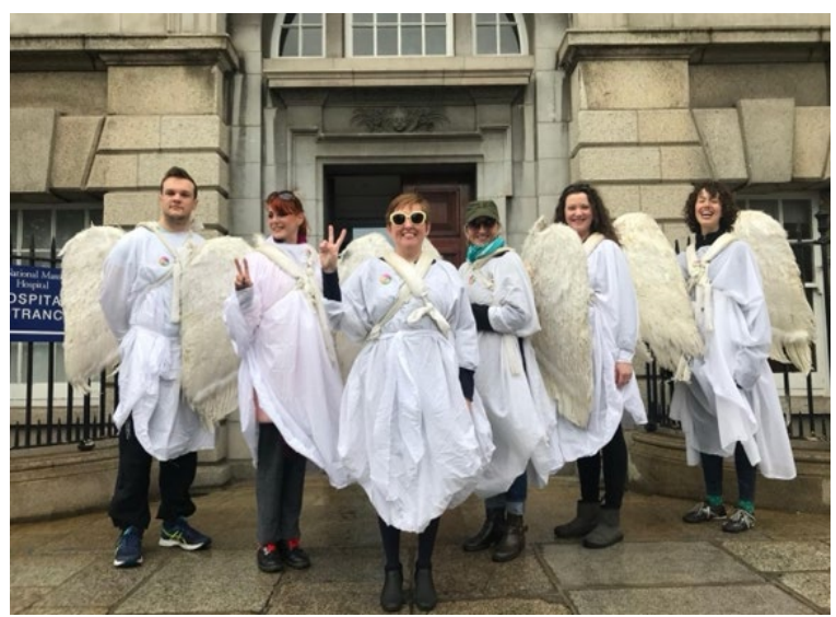
Figure 2. Angels for Choice demonstration, 9 May 2018, The National Maternity Hospital Holles Street, Dublin.

misinformation'<sup>5</sup>. In response graphic foetal image displays by anti-abortion groups, Alliance for Choice installed their own large billboards across Northern Ireland which featured drawings of different types of women and abortion-seekers, in bright colours, with captions including 'Strong', 'Abortion is Normal' and 'All Sort of People Need Abortions'.