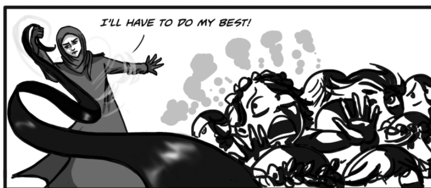
Figure 5. Mohammed, D. (2013). Qahera the Superhero , Egypt, Tumblr, July 20 th , 2013. © D. Mohammed.

In the FEMEN comic the creator appears to draw a direct allusion to Wonder Woman, a feminist superhero who has also faced criticism for being too sexualised, as indicated in the UN's brief choice for Wonder Woman as an ambassador for the empowerment of women and girls for which they faced intense backlash for choosing an icon that was decidedly too sexualised. After protests and an online petition was launched, the decision to use her as an icon was rescinded (Ross, 2016). A hallmark weapon of Wonder Woman is her magic lasso, so when in the FEMEN comic Qahera uses her sash as a make-do lasso to capture the FEMEN protestors, this allusion appears deliberately intertextual. Another interpretation of Qahera's ad-hoc lasso can be to suggest a sense of solidarity with other iconic female superheroes and an attempt to indigenise the superheroine trope to an Egyptian Muslim audience. From this angle, the comic can be read as one that builds solidarity with feminist allies. (It is also quite possible that the comic was providing commentary on the policing of women's choices in dress as well.)