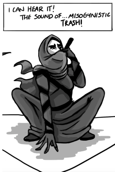
Figure 7. Mohammed, D. (2013). Qahera the Superhero , Egypt, Tumblr, June 30 th , 2013. © D. Mohammed.

misconceptions of the veil and Muslim women's representation but also potentially a learning space for them. For Muslim audiences in the west, it can function more as a space for solidarity. And for Egyptian audiences, it can function as a space for both familiarity and solidarity for specific political themes such as the refugee crisis in 2015.