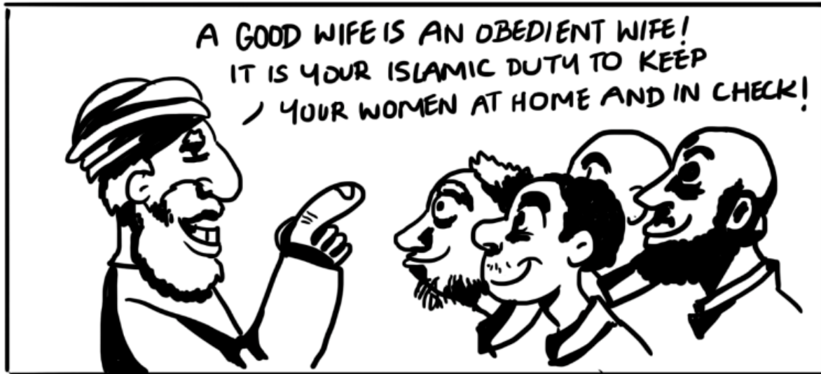
Figure 3. Mohammed, D. (2013). Qahera the Superhero , Egypt, Tumblr, June 30 th , 2013. © D. Mohammed.

Qahera is an allegory that synchronises the hybridity of text and images closely together. In ‘Part 1: Brainstorm’, the comic starts off with the veiled superheroine denoting ‘misogynistic trash’ with her supersonic ears before a comic panel cuts to a cleric telling a group of men that the best wife is an obedient wife (Mohammed, 2013). Soon after Qahera attacks the surprised cleric and hangs him on a clothesline with two laundry clips before telling him that he’s right that ‘housework is women’s work absolutely’ (Mohammed, 2013). As noted in ‘Part 10: On basic equality and such’, she pokes fun at an ignorant bystander who insults her incessantly. It ends with her saving someone who looks like him with him finally giving his nod of approval. The point of the comic is to make jest out of conservative Muslim masculinity. Qahera is often regarded as satirical for this reason.