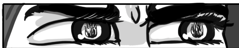
Figure 8. Mohammed, D. (2013). Qahera the Superhero , Egypt, Tumblr, July 20 th , 2013. © D. Mohammed.

While Dust is veiled, she is still sexualised with the form-fitting abaya and niqab with coquettish and startled eyes when viewed up close. Mohammed's character on the other hand is not sexualised and not subject to the male gaze. Panels of the superheroine's eyes betray expressions of anger and frustration when she hears for example the misogynistic cleric. When one considers the cover of New X-Men #133 where Dust's alluring green eyes and startled expression stares back at the reader, one can't help but think that they were drawn to accentuate her 'exoticism' as opposed to reveal anything substantial about the inner character. With that said, perhaps the one ground-breaking aspect of Dust lies in the fact that she was the first Muslim superhero in the post-9/11 era and it is possible that her representation as a Muslim superhero inspired the later Muslim superheroes in comics such as Kamala Khan, and the characters in The 99 . From that aspect, her representation was necessary in its own way.