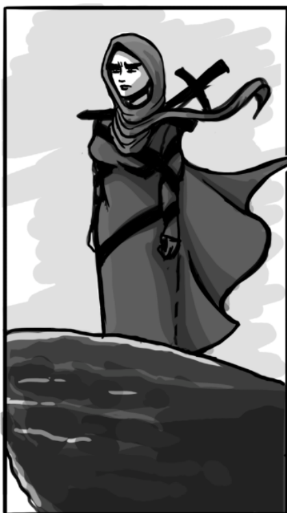
Figure 2. Mohammed, D. (2013). Qahera the Superhero , Egypt, Tumblr, June 30 th , 2013.

Duncan is not the only scholar to note the uniqueness of comics in deconstructing the veil, and orientalism/Islamophobia. Gillian Whitlock also discusses veiling when she analyses Persepolis in her chapter 'Autographics' in her book Soft weapons (2007). When examining the use of the veil in Satrapi's schoolyard playground, Whitlock remarks on its triviality to young Muslim girls when Satrapi and her peers use it as a toy to play skipping, rather seeing it as a 'piece of cloth, and its fetishization by adults can seem strange' (Whitlock, 2007: 190). This kind of critical intervention is novel for it treats the veil as an insignificant artefact of no real importance which is a perspective that is rarely ever communicated in popular culture. Similarly, Qahera seems to reduce this over-worked cultural symbol, as to her it is only useful in the superhero wardrobe. The costume does not wear the character but rather the other way around, unlike the case with Dust .