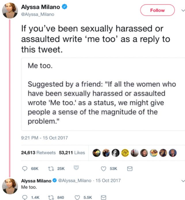
Figure 1. Milano, A. (Alyssa_Milano). 15 October 2017, 9:21 p.m. Tweet