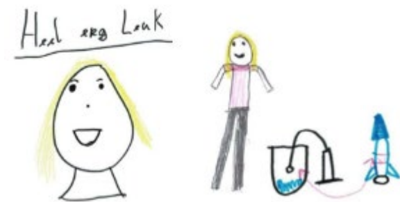
Figure 2. One pupils’ drawings showing emotion during the IBSE activity [Note: The statement above the drawing can be translated as “very much fun”]

On the other hand, the main weakness mentioned by the participants is that the drawings were often unclear and not specific enough for the participants to know how to improve their pedagogical skills.