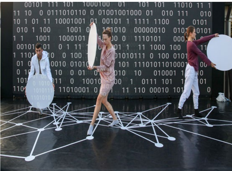
Figure 5. Representation of modern communication based on mathematics at the rehearsal