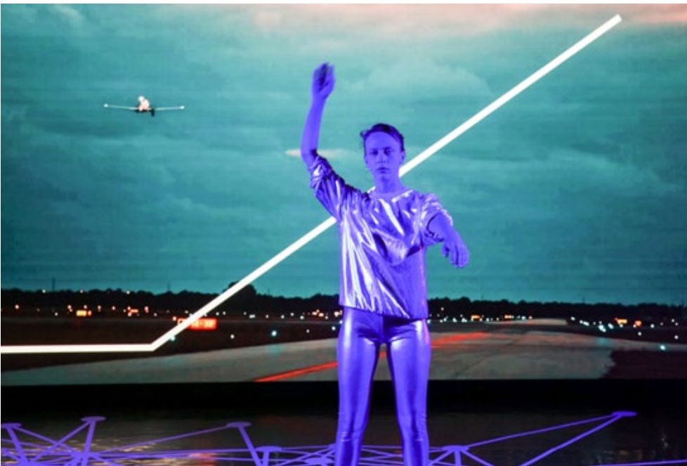
Figure 3. The artistic representation of linear function

hand of Sam Rosenzweig, a surviving Auschwitz victim” in order to illustrate how numbers might strip the richness of the meanings. As above mentioned this is also the most critical, socially engaged scene in the performance.