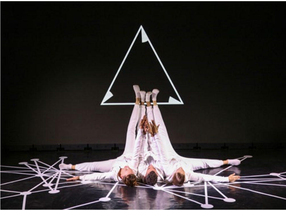
Figure 2. Performance of mathematical theorem