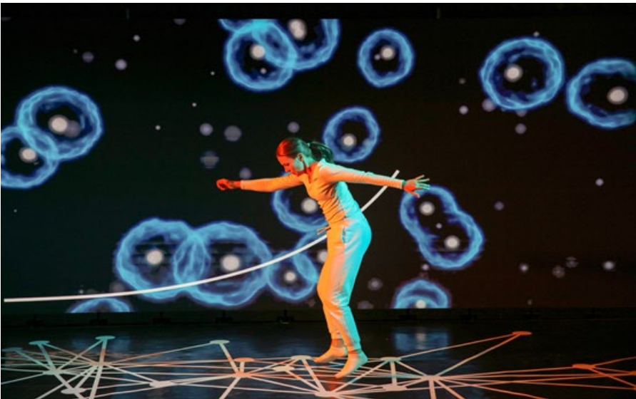
Figure 4. The artistic representation of exponential growth